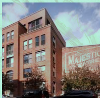
Majestic Theatre Condominiums 222 Montgomery Street Jersey City, NJ 07302

Fulfill your need to explore beautiful art in our lobbies!