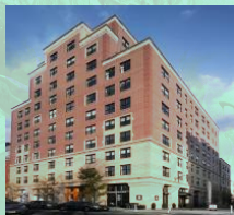
Hamilton Square 232 Pavonia Avenue Jersey City, NJ 07302